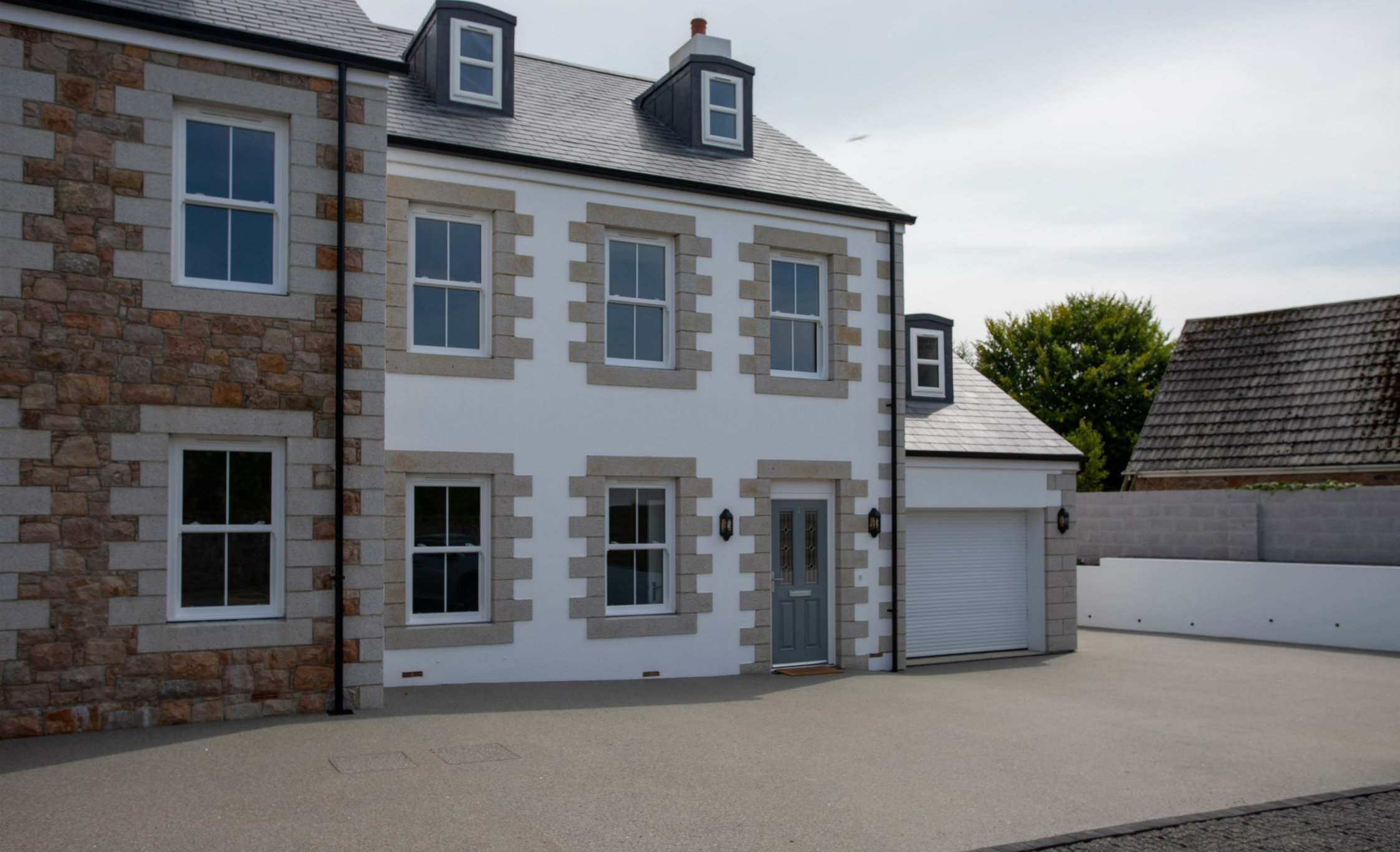
2 Clos de Jambart, Rue de Jambart, St Clement, Jersey, JE2 6LB £1,295,000